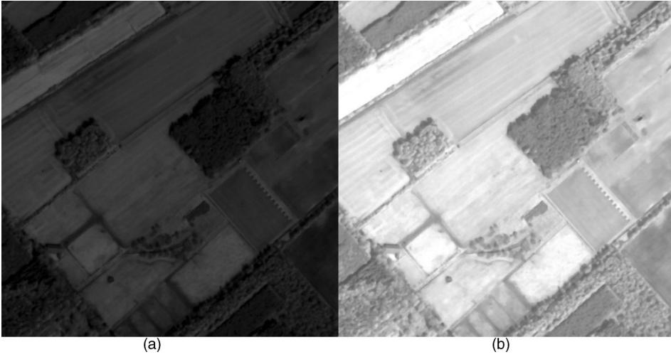
Figure 2. Ikonos image of fields and forests (left). Same image but after a multiplication of grey levels by two.