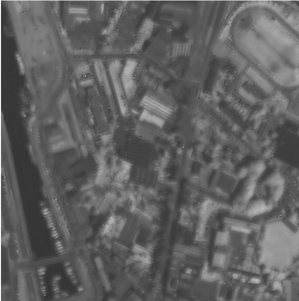
Fig. 4. An excerpt of the image synthesized at 1 m by the UWT-RWM method.