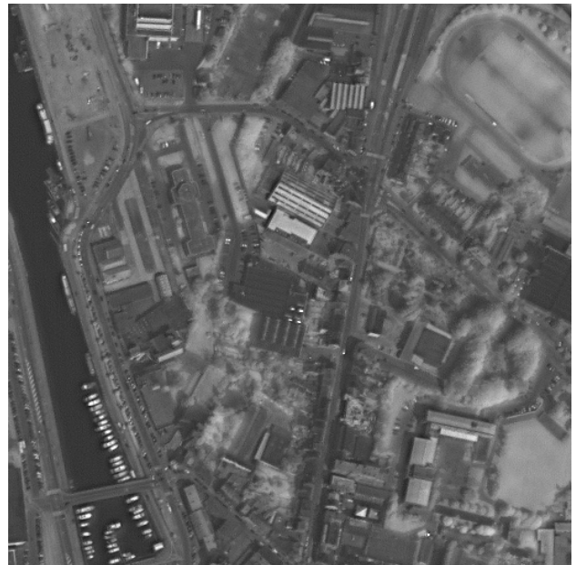
Fig. 7. As Fig. 4, but for the UWT-M2 method.