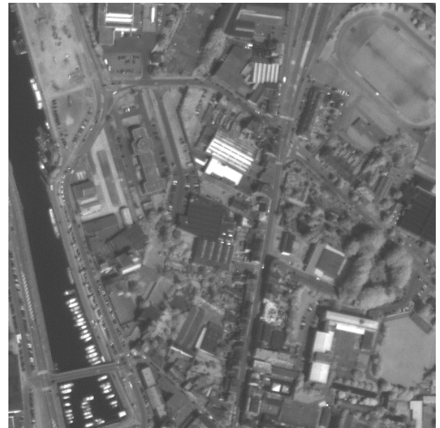
Fig. 2. An excerpt of the PAN image at 1 m.

Figure 2 shows an excerpt of the PAN image at 1 m. On the left, there is a river, crossed by two bridges, with small boats and several barges. Along the river bank is a main street. Several cars are visible. This area is mainly an industrial district with large buildings, surrounded by numerous trees. On the top right is a stadium. Its lawn is partly degraded. Figure 3 presents an extract of the same area in near infrared (NIR) band with a spatial resolution of 4 m. This NIR band is generally the most difficult to synthesize and is a good comparison case for the different methods.