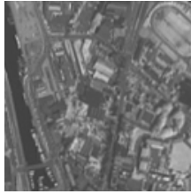
Fig. 3. An excerpt of the NIR image at 4 m.