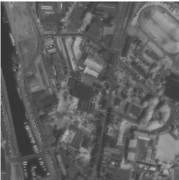
Fig. 5. As Fig. 4, but for the UWT-ATS3 method.