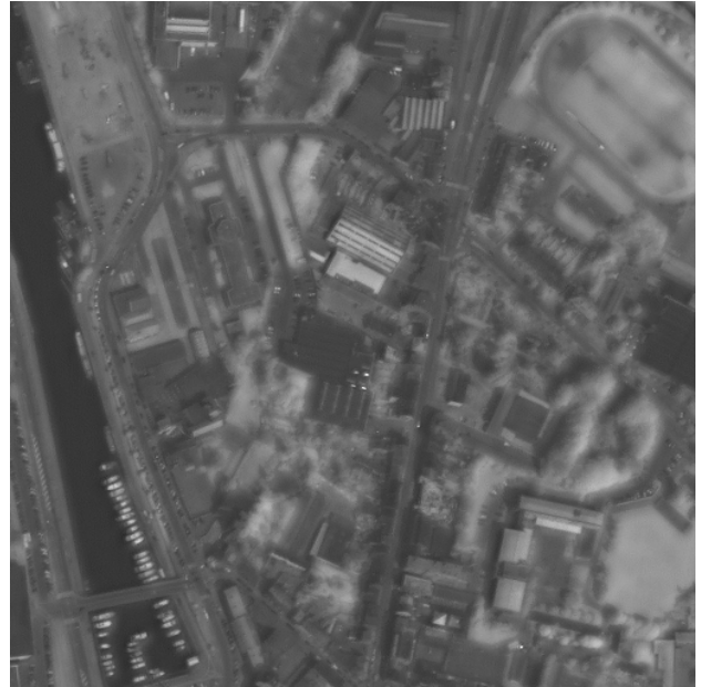
Fig. 6. As Fig. 4, but for the UWT-M1 method.