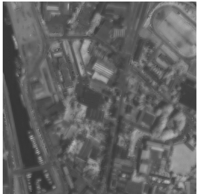
Figure 4. An excerpt of the image synthesized at 1 m by the UWT-RWM method.

The visual quality of each product is very different. The UWT-RWM image (Fig. 4) presents a smooth aspect. The objects are difficult to distinguish. One can observe a granular aspect (see e.g. the stadium). The objects are not enough contrasted. A kind of halo seems to surround many objects in the UWT-RWM image; see in particular the boats and the stadium. The UWT-ATS3 image (Fig. 5) is of better visual quality. The objects are easier to distinguish. However, the visual quality is not satisfactory. The UWT-M1 image (Fig. 6) presents a visual quality similar to the UWT-ATS3 one, but a bit inferior. The UWT-M2 image offers the best definition of objects. It allows a better recognition and identification of the objects in the image.