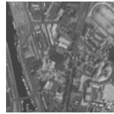
Figure 3. An excerpt of the NIR image at 4 m.