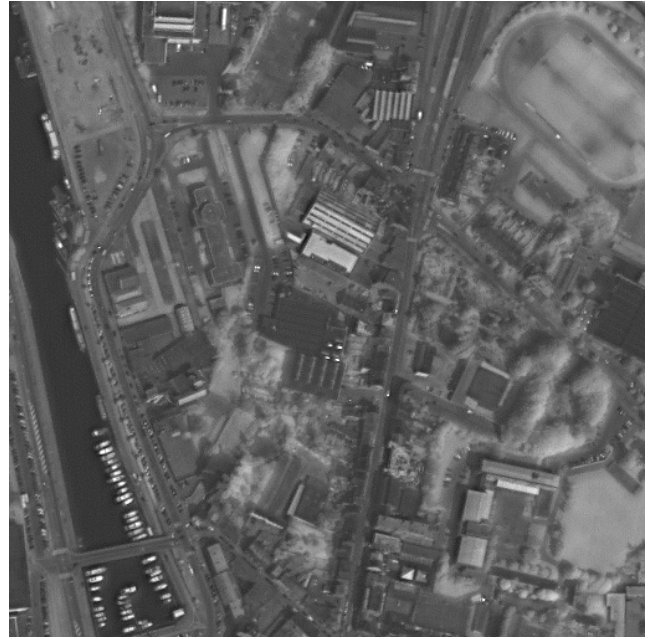
Figure 7. As Fig. 4, but for the UWT-M2 method.