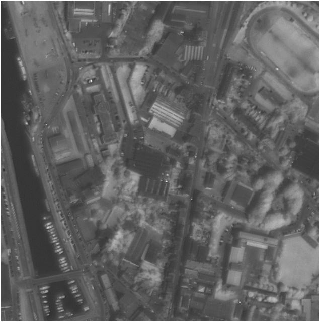
Figure 5. As Fig. 4, but for the UWT-ATS3 method.