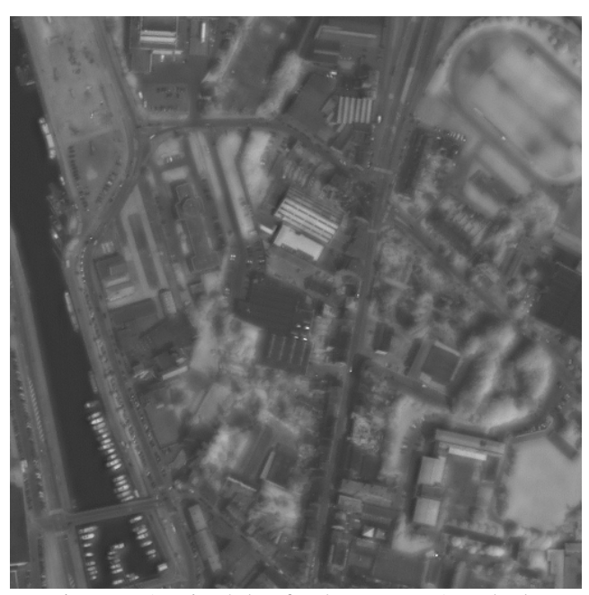
Figure 6. As Fig. 4, but for the UWT-M1 method.