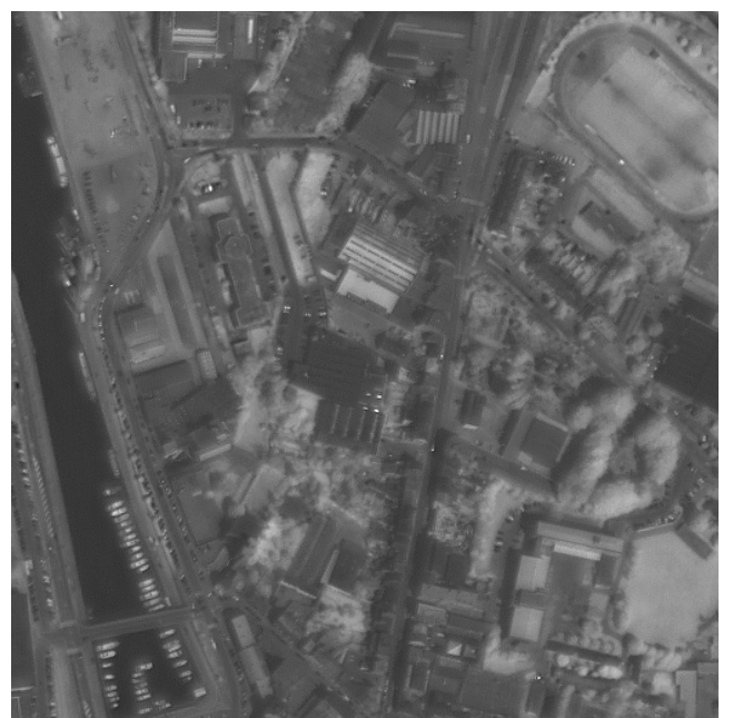
Figure 5. As Fig. 4, but for the UWT-ATS3 method.