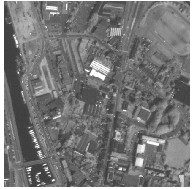
Figure 2. An excerpt of the PAN image at 1 m.

Figure 2 shows an excerpt of the PAN image at 1 m. On the left, there is a river, crossed by two bridges, with small boats and several barges. Along the river bank is a main street. Several cars are visible. This area is mainly an industrial district with large buildings, surrounded by numerous trees. On the top right is a stadium. Its lawn is partly degraded. Figure 3 presents an extract of the same area in near infrared (NIR) band with a spatial resolution of 4 m. This NIR band is generally the most difficult to synthesize and is a good comparison case for the different methods.