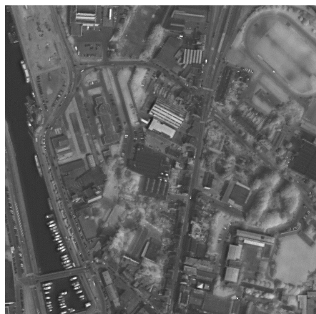
Figure 7. As Fig. 4, but for the UWT-M2 method.