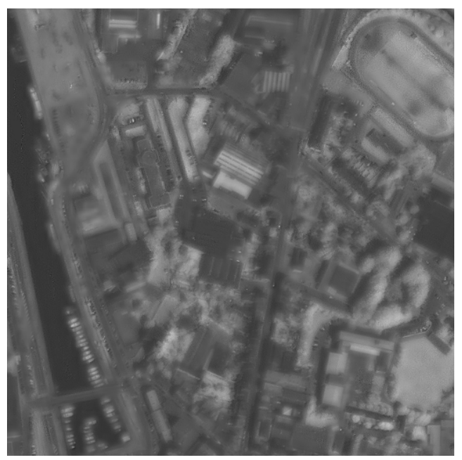
Figure 4. An excerpt of the image synthesized at 1 m by the UWT-RWM method.

The visual quality of each product is very different. The UWT-RWM image (Fig. 4) presents a smooth aspect. The objects are difficult to distinguish. One can observe a granular aspect (see e.g. the stadium). The objects are not enough contrasted. A kind of halo seems to surround many objects in the UWT-RWM image; see in particular the boats and the stadium. The UWT-ATS3 image (Fig. 5) is of better visual quality. The objects are easier to distinguish. However, the visual quality is not satisfactory. The UWT-M1 image (Fig. 6) presents a visual quality similar to the UWT-ATS3 one, but a bit inferior. The UWT-M2 image offers the best definition of objects. It allows a better recognition and identification of the objects in the image.