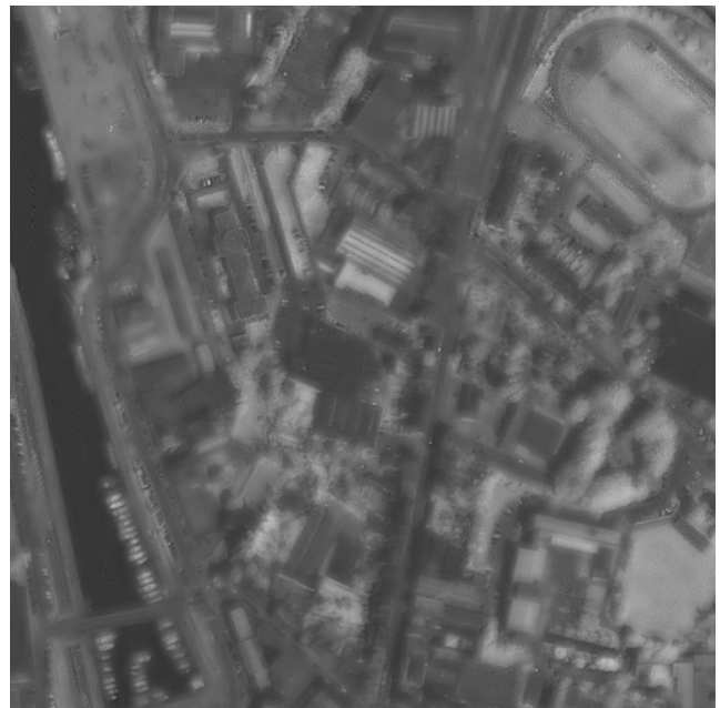
Figure 4. An excerpt of the image synthesized at 1 m by the UWT-RWM method.

The visual quality of each product is very different. The UWT-RWM image (Fig. 4) presents a smooth aspect. The objects are difficult to distinguish. One can observe a granular aspect (see e.g. the stadium). The objects are not enough contrasted. A kind of halo seems to surround many objects in the UWT-RWM image; see in particular the boats and the stadium. The UWT-ATS3 image (Fig. 5) is of better visual quality. The objects are easier to distinguish. However, the visual quality is not satisfactory. The UWT-M1 image (Fig. 6) presents a visual quality similar to the UWT-ATS3 one, but a bit inferior. The UWT-M2 image offers the best definition of objects. It allows a better recognition and identification of the objects in the image.