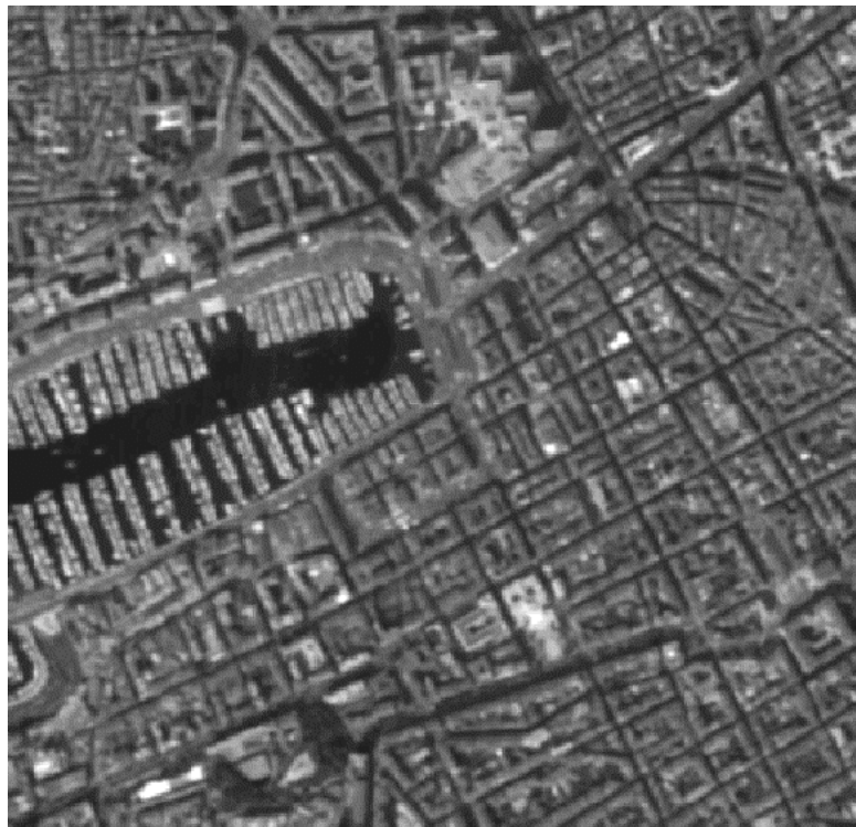
Figure 1. Panchromatic image of the oldest part of the city of Marseille, France. The spatial resolution is 2.5 m.