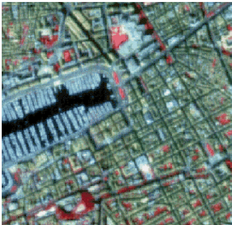
Figure 2. Color composite of the same area of Marseille. Spatial resolution is 5 m.