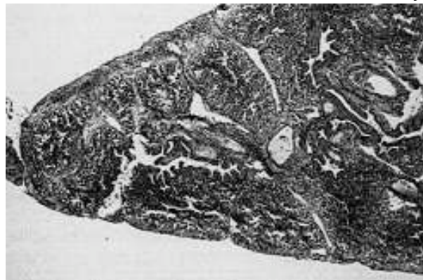
FIG. 3. - Fetal lung : picture of excessive number of bronchi with peripheral bronchi, with or without cartilage (Gr. X 30 HPS, r d. 0,76).

Like other authors, we had difficulty in assessing RA count. When there is major superimposed disease, it is more difficult to identify the bronchioli if the lining is damaged or if the distal airways are not clearly differentiated. We observed a wide range in values, with 9 cases having a count higher than the mean and 15 a count between the mean and standard deviation. These results are consistent with those reported elsewhere, in particular in the studies of Hislop et al. (8), Chamberlain et al. (9), and Emery and Mithal (2). As one possible explanation of the discrepancy in values, these authors point to their observation that there were fewer divisions of the bronchi and bronchioli. Thus, while the number of alveoli counted was normal, with a normal or high RA count, the total number of alveoli was actually low.