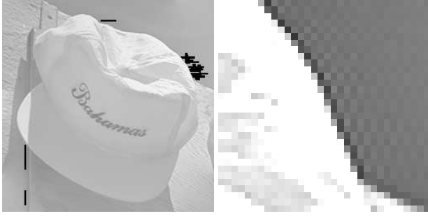
Fig. 2. The “caps” image from the Live database is not compliant with sinc interpolation: ringing is detected (black zones on the left image) after an horizontal translation of 0.5 pixel, especially near the topright corner of the cap. The image on the right zooms on this part, with contrast magnification and no detection marked.

high-frequency components of the shrunk image up to the point where the ringing artifacts disappear (but not further in order to introduce as little blur as possible). In practice, we considered a family of parametric filters and used the ringing detection to select the optimal value of the parameter, that is the first one yielding no ringing (see Fig. 3, bottom row). Compared to systematic lowpass filtering (see [9] in particular), the interest of this method is that it does not introduce a systematic amount of blur, but only the minimal necessary amount, so that if the initial image is already blurry, the obtained shrunk image will be much sharper and precise than with generic lowpass filtering. Of course, another interest is that the algorithm guarantees that the resulting image is Shannon-compliant, which opens interesting perspectives concerning subpixel accuracy.