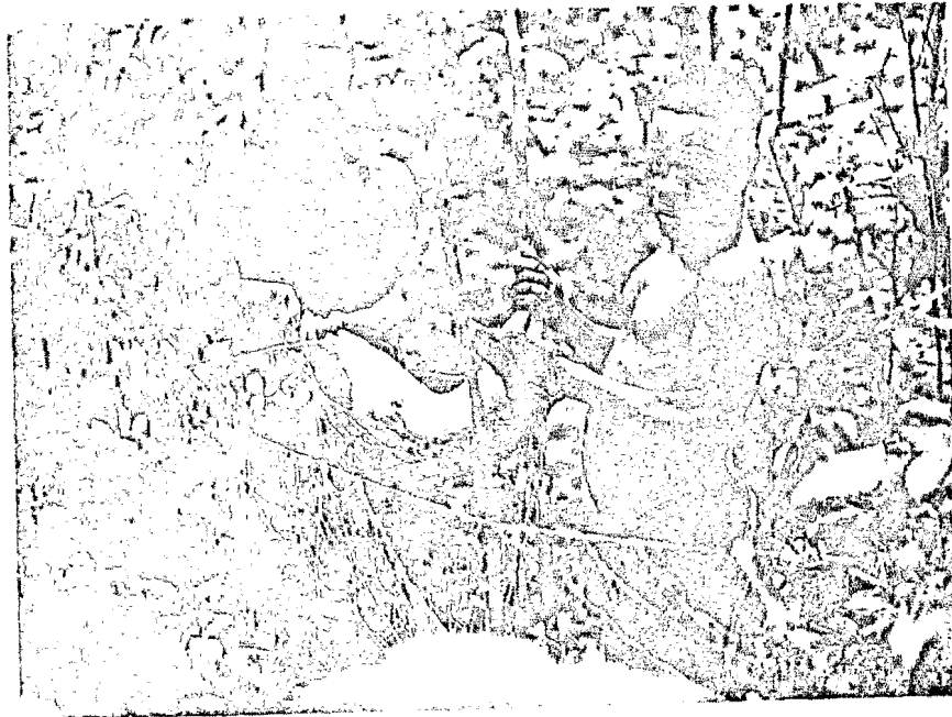
Aka Pygmy net hunters procure game in part to trade with farmers. Pygmies may have originally adopted the net-hunting technique from their farming neighbours (S. Bahuchet)

Migratory movement would have been primarily by canoe along the coast and the waterways, and settlement concentrated in riverine areas with rich alluvial soils. The economy would have been based upon yams for starches, palm oil for lipids and fish as the main source of animal protein, although goats may have accompanied the immigrants and Pygmy-Bantu symbiosis have provided the latter with game and other forest produce. (David forthcoming)