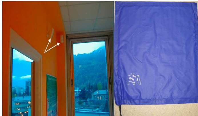
Fig. 1. infrared (arrows) for localizing dependent people in a health smart home (left) & pressure sensors (right: FSA Seat 32/63 pressure mapping system, Vista Medical Ltd.)

watching), and to follow up the succession of these numbers, e.g. by interpreting them as the succession of colors of balls drawn from a Polya's urn: in this kind of urn, the persistence (or a contrario the unstability) of an action in a location is represented by adding n_i(k(i)) balls of color k(i) , when a ball of color k(i) has been obtained at time i . If n_i(k(i)) depends only on i through k , the random process constituted by the succession of the n(k(i)) 's is called homogeneous and a change in homogeneity can be detected by estimating the n(k) 's and testing their significant consecutive differences. We will give in the following elements of material and methods in order to describe more precisely the data collection and treatment procedures, and then we will discuss the pertinence of such a research protocol and its implementation in the current life of dependent people at home.