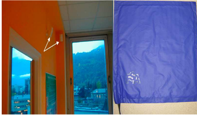
Fig. 1. infrared (arrows) for localizing dependent people in a health smart home (left) & pressure sensors (right: FSA Seat 32/63 pressure mapping system, Vista Medical Ltd.)

watching), and to follow up the succession of these numbers, e.g. by interpreting them as the succession of colors of balls drawn from a Polya's urn: in this kind of urn, the persistence (or a contrario the unstability) of an action in a location is represented by adding n_i(k(i)) balls of color k(i) , when a ball of color k(i) has been obtained at time i . If n_i(k(i)) depends only on i through k , the random process constituted by the succession of the n(k(i)) 's is called homogeneous and a change in homogeneity can be detected by estimating the n(k) 's and testing their significant consecutive differences. We will give in the following elements of material and methods in order to describe more precisely the data collection and treatment procedures, and then we will discuss the pertinence of such a research protocol and its implementation in the current life of dependent people at home.