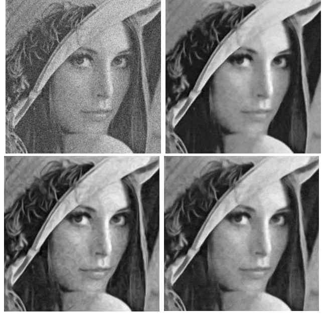
Fig. 2. Comparison of restored images. (In lexicographic order) Noisy image, UINTA restored, k NN restored ( k = 10 ) and k NN restored ( k = 40 ).

We propose, as an alternative solution, to weight the contribution of the samples. Intuitively, the weights must be a function of distance between the actual sample and the