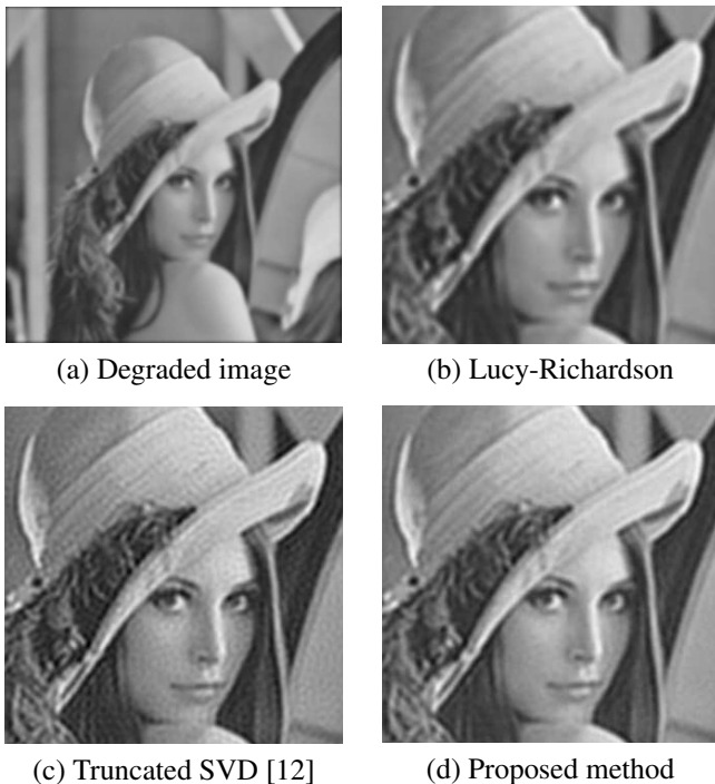
Fig. 4. Comparison of deconvoluted images. Gaussian Mixture noise, entropy 1.85 bits. (a) The blurred noisy image (PSNR = 25.33[dB], SSIM = 0.837)