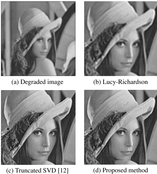
Fig. 3. Comparison of deconvoluted images. Uniform noise, entropy 2 bits. (a) The blurred noisy image (PSNR = 25.30[dB], SSIM = 0.837)