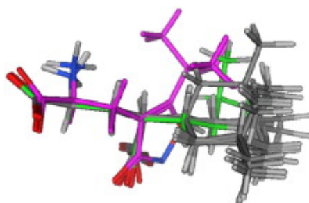
Fig. 3. Superimposition of low-energy conformations of 1g ( \Delta\Delta G = 0 to + 1 kcal/mol) (type code/green) and ATPA (purple). The conformation of 1g shown in green resembles the conformation of ATPA best.

Recently we reported the synthesis and pharmacological evaluation of a series of (4 R )-alkyl Glu analogs at EAAT 1–3 (Alaux et al., 2005). In extension from earlier findings, we showed that introduction of a large variety of longer and more bulky (4 R )-alkyl substituents also endorses the folded conformation as the global low-energy conformation of Glu. In comparison, this low-energy conformational preference is also preferred for E -4-alkylidene Glu analogs 2a–h , AMPA, and ATPA (Fig. 3). Furthermore, a general feature for all of these Glu analogs, is the observed increase in preference for the iGlu 5 receptor subtype, as the alkyl group is extended in length and bulk ( 1a → 1g , 2a → 2f and AMPA → ATPA; Table 1). This observation may be explained by comparing the size of the iGlu receptor binding pockets: For subunit iGlu 5 it has been estimated to be approximately 20% larger as compared to subunit iGlu 6 and approximately 50% larger, when compared to subunit iGlu 2 (305 Å, 255 Å, and 218 Å, respectively) (Mayer, 2005).