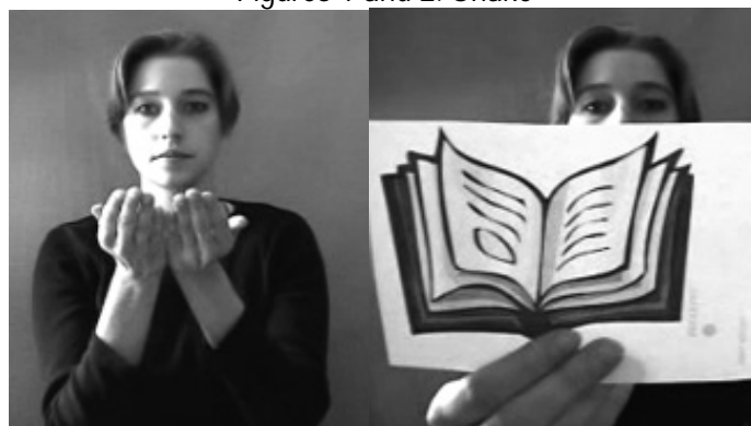
Figures 3 and 4. Book