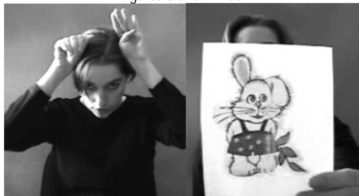
Figures 5 and 6. Rabbit