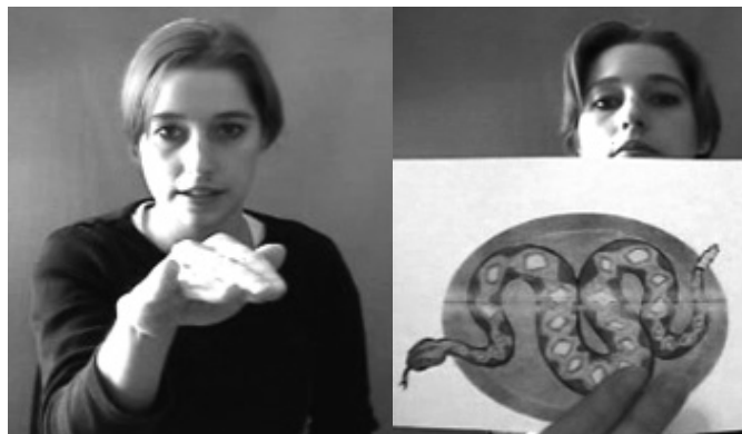
Figures 1 and 2. Snake