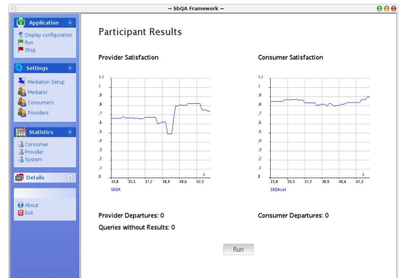
(b) Drawing results on-line