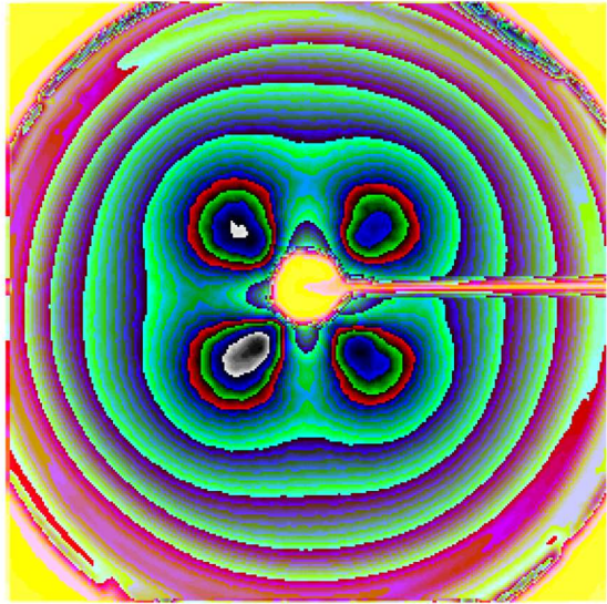
Fig. 2. Contour level image of polarization patterns on the surface of a beaker of a colloidal solution [22] of 2 \mu\text{m} latex beads. Linearly polarized light is incident at a spot at the center of the image. The surface of the beaker is imaged with a camera through a linear analyzer. The analyzer is crossed with respect to the polarization of the incident beam. We see a clear fourfold symmetry in the intensity of the backscattered light with the maximum in inclined intensity at an angle of 45 degrees to the direction of the polarizers.

In systems with weak, large scale heterogeneities, the scattering of a beam of light is largely in the forward direction [20]. Each independent scattering event changes the direction of propagation by some small random angle. We model this process as giving rise to angular diffusion in the propagation direction of the light just as in equation (3). As shown in [21] the helicity of photons is conserved in forward scattering processes over a length which is larger than \ell_p . We shall thus neglect such events in the following discussion. This conservation implies that the polarization vector of linearly polarized light evolves by parallel transport on \mathcal{S}^2 with \mathbf{t} the direction of propagation of the light and \mathbf{n}' the polarization vector during the scattering process. This is exactly the condition needed for the development of a Berry or geometric phase in the scattered light.