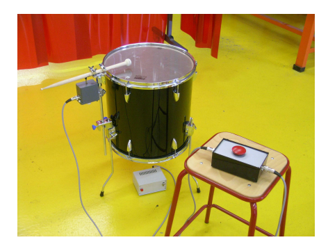
Figure 3 8 years-old girl is playing the tambour with the music professor

It has to take into account the specific handicaps of that young girl and its physical capacities, the paramedical parameters, the requirement of the musical specialist concerning the tambour. After four months of study, two successive prototypes and some experiments in real situation, the team proposed a final system which is shown in situation in figure 3.