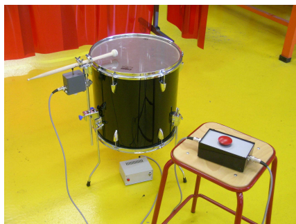
Figure 3 8 years-old girl is playing the tambour with the music professor

It has to take into account the specific handicaps of that young girl and its physical capacities, the paramedical parameters, the requirement of the musical specialist concerning the tambour. After four months of study, two successive prototypes and some experiments in real situation, the team proposed a final system which is shown in situation in figure 3.