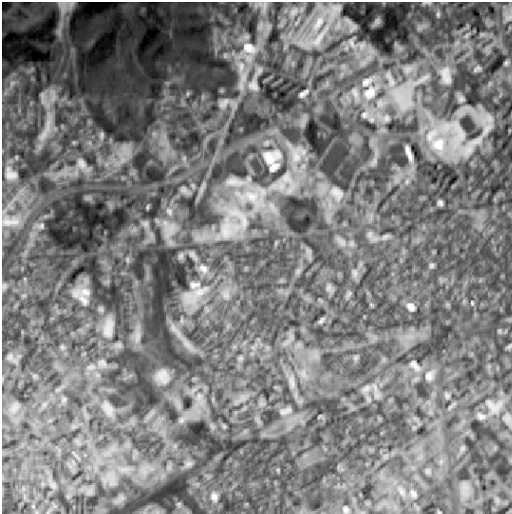
Figure 4. As Figure 3 but XS1-HR.