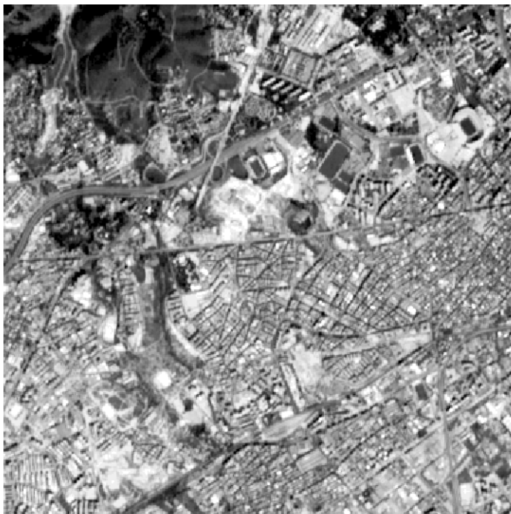
Figure 1. SPOT P image (see text for explanations).