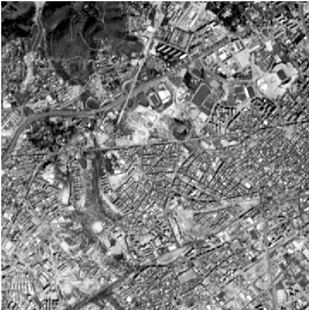
Figure 3. XP1 synthetic image (see text for explanations).