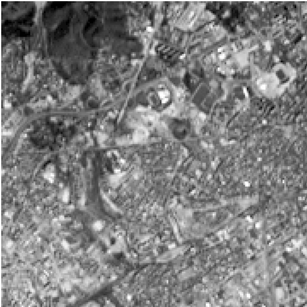
Figure 2. As Figure 1 but SPOT XS1.