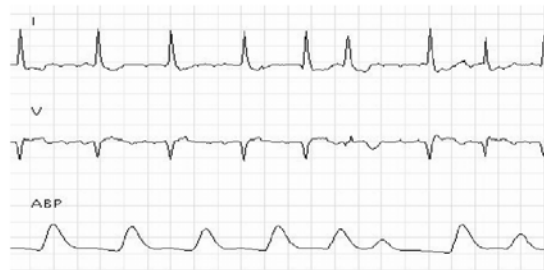
Figure 1 Multisource data: lead I and V of an electrocardiogram and an arterial blood pressure channel

We are particularly interested in learning temporal rules that enable such a multisource detection scheme. To learn these kinds of rules, a relational learning system based on ILP is well-adapted. ILP not only enables to learn relations between characteristic events occurring on the different channels but also provides rules that are understandable by doctors, since the representation method relies on first order logic.