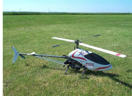
Fig. 2. VARIO Benzin Helicopter.

l_i = \sum_{k=1}^3 l_i^k E_k^a ( i stands for m, t ) represents the distance between the center of gravity and the application point of the force.