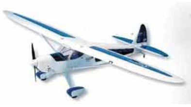
Fig. 1. SIG Rascal 110.

with \omega_j the angular velocity of the rotor, \theta_{T_j} the collective angle, \alpha_{T_j} the angle of attack of blades and the coefficient C_{D_i} the drag of the rotor. The constant C_{M_j} = \frac{1}{4}R_j^3 n_j \bar{c}_j depends on the radius, the number and the mean chord of blades. Besides, the rotor induces a torque C_{air_j}^b due to the air resistance and proportional to \omega_j^2 .