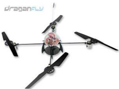
Fig. 3. Dragonflyer V TI-RC.

Theoretically, translational and rotational dynamics ( i.e. : \Sigma\Gamma = 0_{3 \times 1} , \Sigma = 0_{3 \times 3} ) are decoupled.