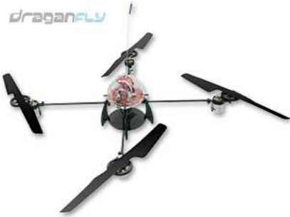
Fig. 3. Dragonflyer V TI-RC.

Theoretically, translational and rotational dynamics ( i.e. : \Sigma\Gamma = 0_{3 \times 1} , \Sigma = 0_{3 \times 3} ) are decoupled.