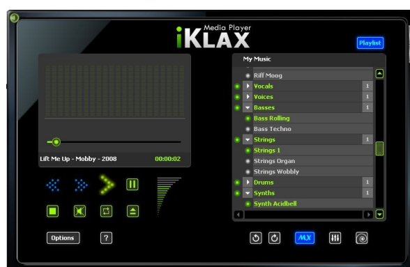
Figure 1. A screenshot of iKlax Player.

The iKlax Player also has all the functionalities of a classic player.