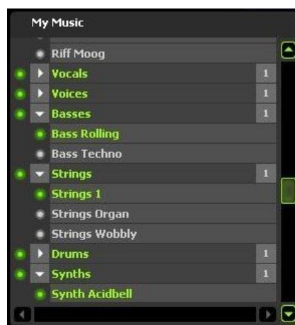
Figure 2. The tracks selection tree of iKlax Player.

The exploration of a file and the selection of tracks to listen to are very easy. Tracks are stored in sub-groups that have been defined by the composer. These groups are displayed in a tree form (see figure 2), a common way of representation, well known by most people: all users (inexperienced users and professional musicians) that test the iKlax Player learn fast how it works.