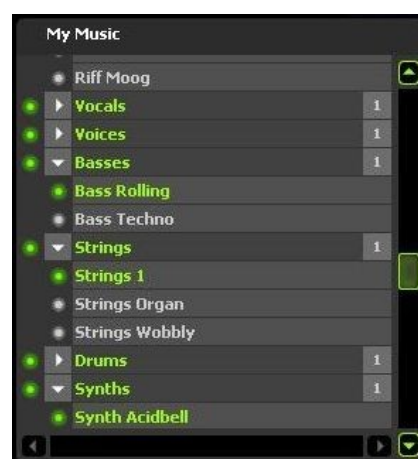
Figure 2. The tracks selection tree of iKlax Player.

The exploration of a file and the selection of tracks to listen to are very easy. Tracks are stored in sub-groups that have been defined by the composer. These groups are displayed in a tree form (see figure 2), a common way of representation, well known by most people: all users (inexperienced users and professional musicians) that test the iKlax Player learn fast how it works.