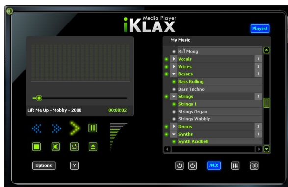
Figure 1. A screenshot of iKlax Player.

The iKlax Player also has all the functionalities of a classic player.