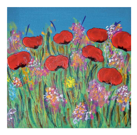
Figure 1. Coquelicots painting by artist Agathe Rémy, who lives near Aix-en-Provence, France. Coquelicots is the French word for poppies.

Agronomy for Sustainable Development (ASD, agronomyjournal.org) is one of the seven journals of the French Institute