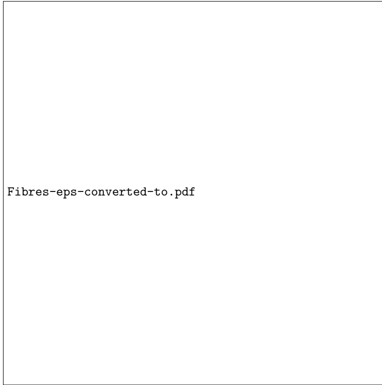
Figure 2: Flow induced aggregation/disaggregation

coexist and two populations can be identified: the one related to free rods (pendant population) and the one associated with the aggregated rods (active population). Figure ?? depicts both populations and the flow induced aggregation/disaggregation.