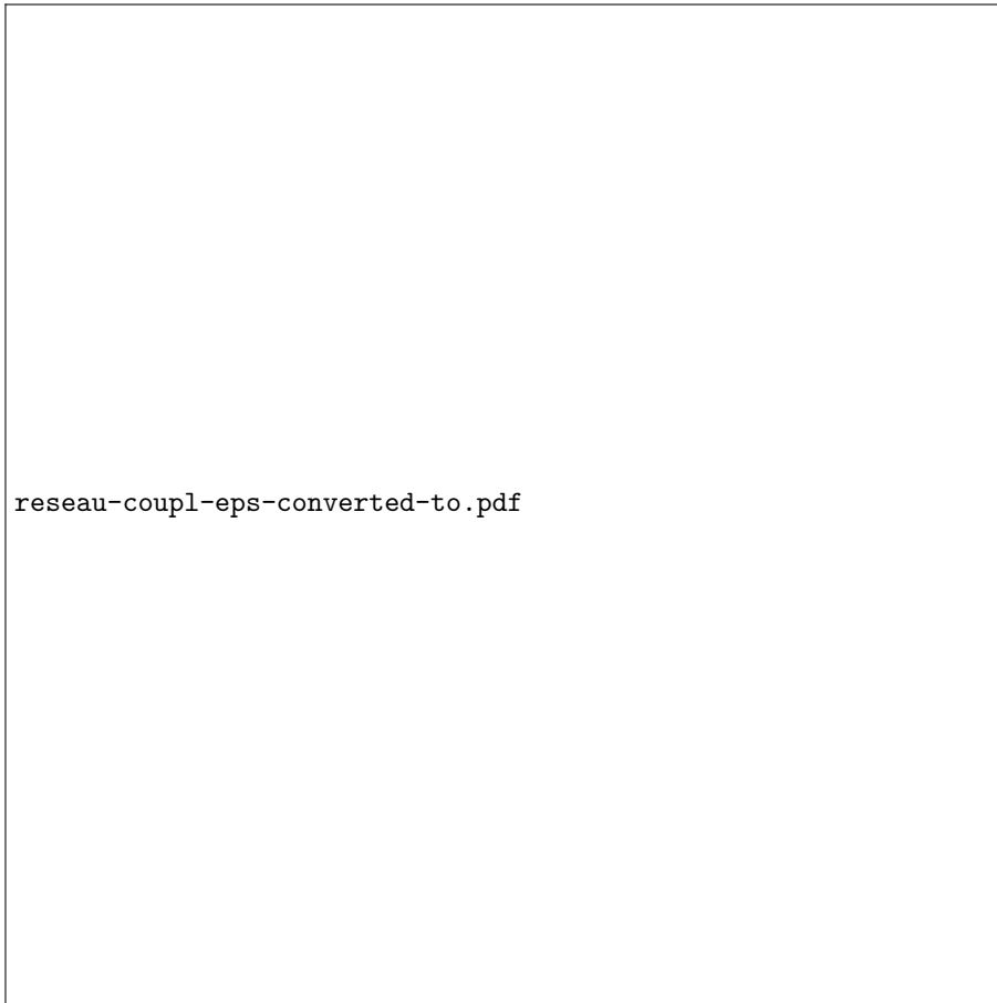
Figure 3: Orientation distribution of active and pendant populations in a contraction flow