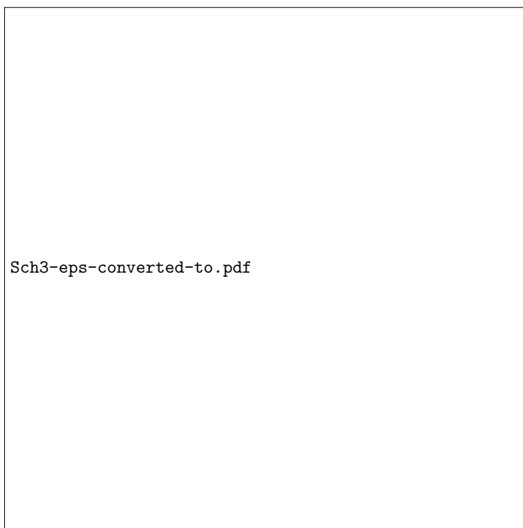
Figure 6: Ground state electronic density for systems composed of 1, 2, 3, 4 and 5 electrons -the Pauli's principle applies-