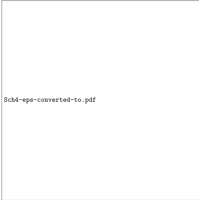
Figure 7: Evolution of the ground state energy when the Pauli's principle is activated