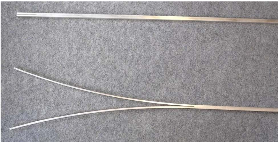
Fig. 1. Deformation of an aluminium rod after cutting, due to the presence of residual stresses, an experiment proposed by Prof. H.D. Bui.

Accurate measurements of residual stresses are performed by non-destructive techniques X-ray diffraction measurements at the surface of structures or by destructive methods: hole-drilling, layer removal, etc., if one wants to explore the residual stress field in depth of the solid. This relies essentially on measuring the stress redistribution produced by matter removal on a body containing residual stresses produced by an incompatible initial thermal or plastic strain distribution. In such a case, one supposes that matter removal leads to an elastic redistribution of stresses and