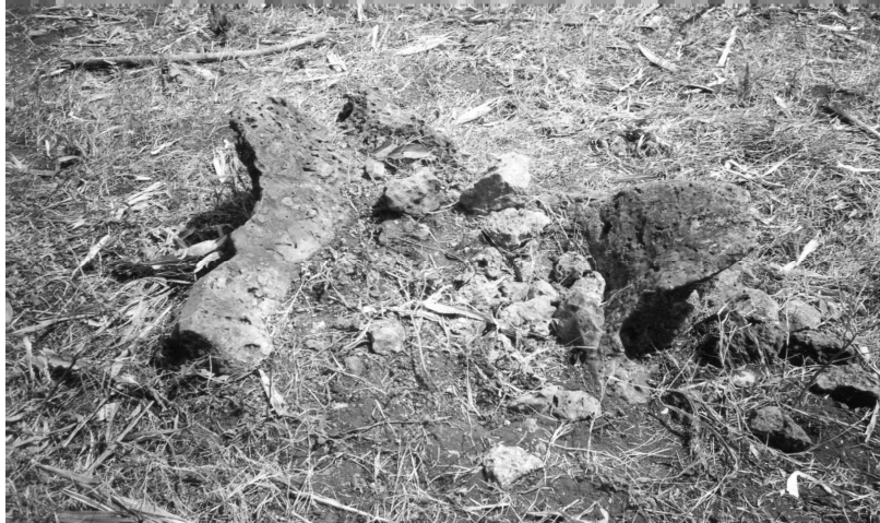
Jeta - 1990

During the 1950s, the festival contained other sequences which no longer take place. At daybreak the women used to meet on the beach to wash themselves and the household utensils 1 , in the same way as widows at the end of their period of seclusion 2 . In Zanzibar town, they would go home dancing the dance of the corpse 3 .