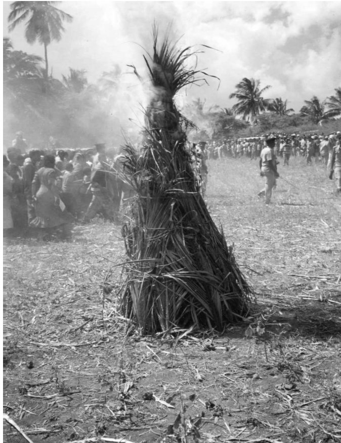
Kibanda cha mwaka - 1990

But the mwaka is not a death. The year dies but it is reborn and, according to the day of the week that it commences, augurs ill or well.