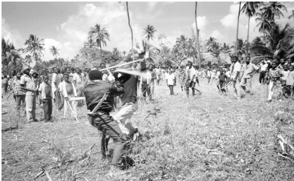
Wanaume wikipigana - 1990

Meanwhile the wavyale become active. Those from the west and, in particular, those from the small mzimu who are also wavyale of Majipeponi, request happiness and prosperity and make an offering of meat, honey and of biscuits which are round and oblong, symbolizing the two sexes.