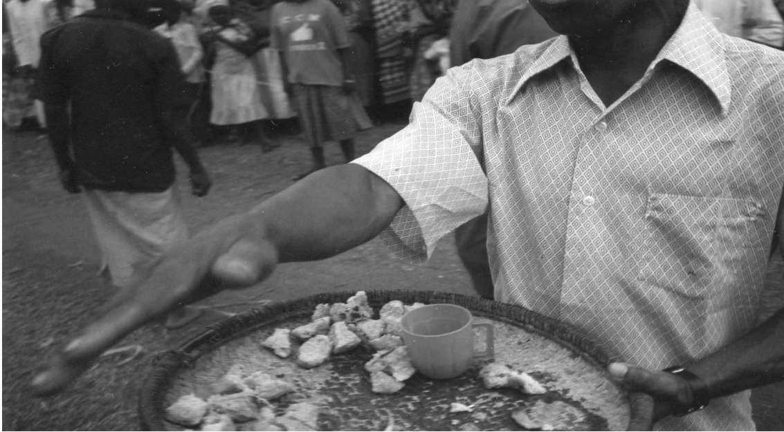
Bisukuti - 1990

To the east, other wavyale , all men, build a hut of millet straw and make the same offering as the wavyale of the small mzimu . A man enters the hut, while the women tighten the circle, singing Napindukia, napindukia . Then the but is set on fire. The mvyaie who is inside, rushes out and flees to the east, towards what was in former times thick bush. On his way he must pass over a stone known as Jeta because of its form 1 which contains medicines ( dawa ). As the hut becomes enveloped by flames, the crowd throws stones at the fire, shouting: