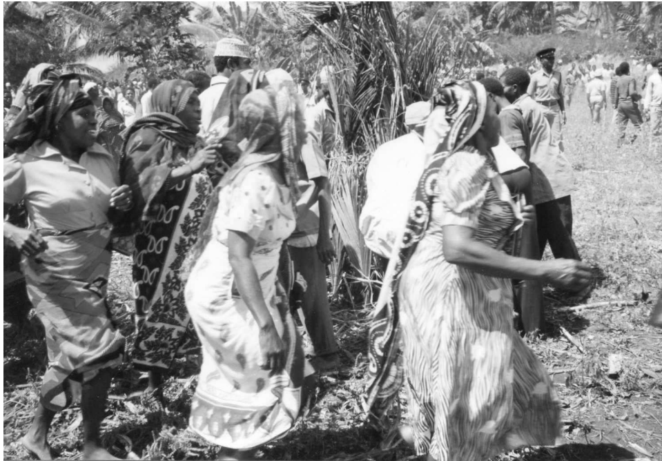
Wanawake wakiimba - 1990