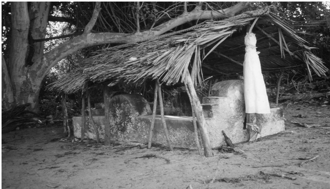
Mzimu wa Mabuko - 1992

In Makunduchi, the caves are considered to be places chosen by the spirits themselves, whereas the butts, which always face west, seem to be tombs. Such details are, however, rarely still remembered though this is not the case for Mabuko , on the beach at Kigaeni. This mzimu , celebrated for its power, is said to be the tomb of a leper.