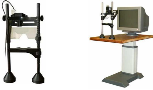
Fig. 1. Eye tracking apparatus