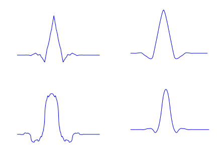
Fig. 1. Top left \phi , top right \tilde{\phi} , bottom left \Phi^{(1)} , bottom right \tilde{\Phi}^{(1)} where \phi, \tilde{\phi} are compactly supported B-spline 4 4