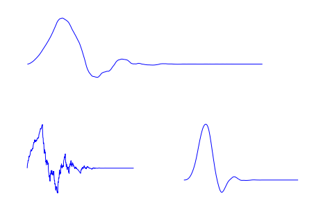
Fig. 3. Top left \phi , bottom left \Phi^{(1)} , bottom right \tilde{\Phi}^{(1)} where \phi is the Daubechies Wavelet with 4 vanishing moments