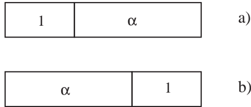
Figure 2: a) J_1 before J_2 ; b) J_2 before J_1

Theorem 2. For any \gamma > 1 , there is an instance such that no (x, y) -schedule with 1 < x < 1 + \frac{1}{\gamma} and 1 < y < 1 + \frac{\gamma-1}{2+\gamma} exists.