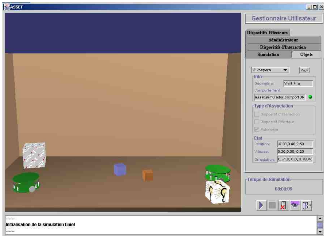
Figure 3. User interface of ASSET system

new environment. This unit filters information to obtain the needed data for making a choice of behaviour and update his state. Finally, the two Khepera robots execute their commands. The Khepera autonomous robot is guided by the behavioural unit associated with the remote simulator, allowing the A3 system to only work with valid global data. The unit in user simulation just produce visual feedback. The strong object-oriented model of the ASSET system allows for easy reconfiguration of the robots. Furthermore, because this model separates the geometric robot model from its intermediate control layers, we can develop and evaluate the different application components separately.