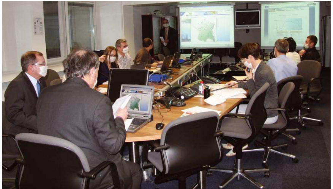
The EDF crisis room in action during a pandemic crisis exercise. The RRF tested its mettle in the course of two exercises, dealing with pandemic and nuclear-related scenarios, and proved itself not only to be useful, but truly essential for upper-echelon leaders

outdated. Our best practice still lags one war behind. Unfortunately, official reports often do little more than string together a litany of recommendations that call for more of the same. Such conventional thinking is not the way to confront emerging risks and crises.