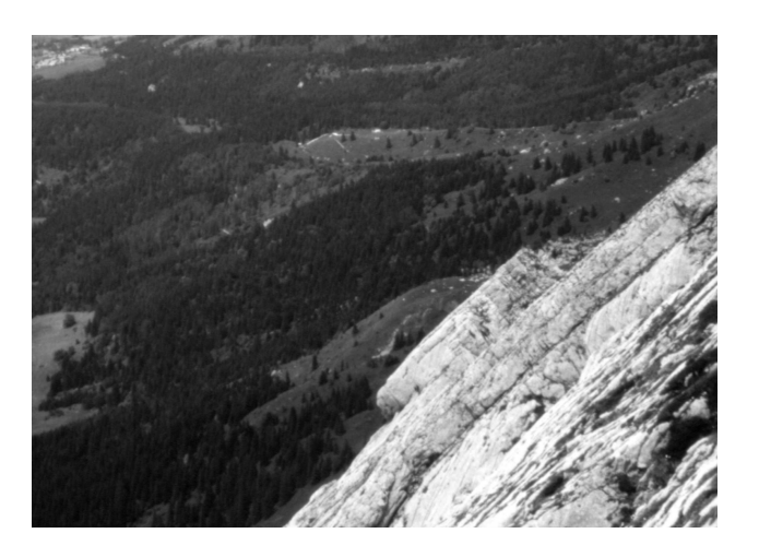
Figure 1. A potentially unstable rock mass of about 10,000 \text{ m}^3 . The slab is 6 m thick. The potential failure mechanism is a plane slide.

cal, Geomechanical, Probabilistic), combines the results of geomechanical and historical analyses to estimate the failure probability (Dussauge et al. 2001; Vengeon et al. 2001; Hantz et al. 2002). Knowing the failure probability of a given rock volume in the slope and the propagation probability to any point downhill, the real reach probability of any point could be calculated and compared with the probabilities of other natural hazards like earthquakes or floods. This comparison may be useful for land use policy.