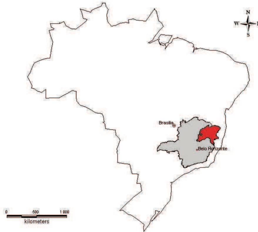
Fig. 1. Map of Brazil showing the project's region within the State of Minas Gerais. The project area is coloured in red.