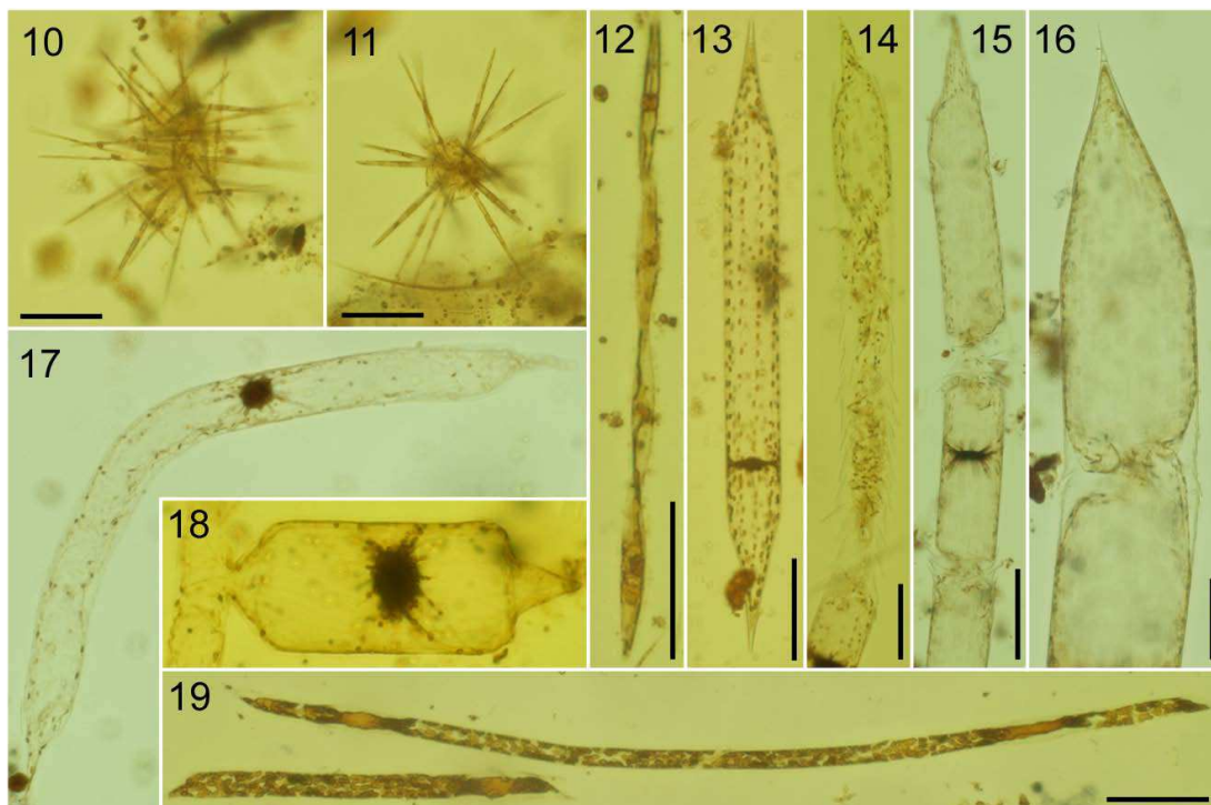
Figs. 10–19. Photomicrographs of microphytoplankton in the SE Pacific. (10–11) Clusters of Pseudo-nitzschia delicatissima , 20 m and 30 m depth. (12) Pseudo-nitzschia cf. subpacificca , 5 m depth. (13) “Normal” cell of Rhizosolenia bergonii , 60 m depth. (14) R. bergonii with fragmented frustule, 20 m depth. (10–14) 8°23′ S; 141°14′ W. (15) R. bergonii with fragmented frustule, 30 m depth. (16) Rhizosolenia acuminata , 5 m depth. (14–16) 9° S, 136°51′ W; 30 and 5 m depth). (17) Curved cells of R. bergonii (13°32′ S, 132°07′ W, 5 m depth). (18) Auxospore of R. bergonii , 33°21′ S, 78°06′ W, 5 m depth. (19) Highly pigmented cells of Rhizosolenia sp. (17°13′ S, 127°58′ W, 210 m depth). Scale bar = 100 μm.