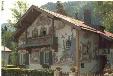
(b) Toyama database (DMOS = 3.5)