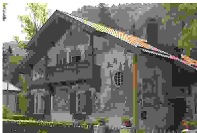
(c) LIVE database (DMOS = 65)