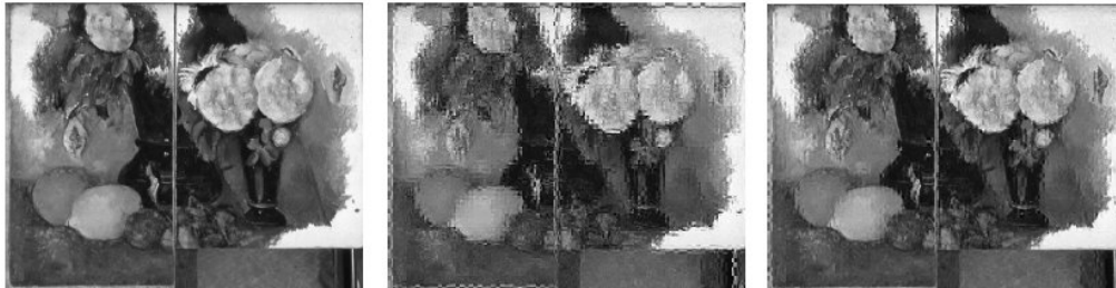
Figure 4. a) Work-of-art original image 512×640, b) Ciphred image for C = 128, c)

Selective encryption (SE) is a method that encodes only the most important portion of the data in order to provide a proportional privacy and to reduce computational requirements. The objective of our work is to leave free the low-resolution image and give full-resolution access only for authorized person. This approach is based on AES stream ciphering using VLC (Variable Length Coding) of the Huffman's vector. The proposed scheme allows decryption of a specific region of the image and results in a significant reduction in encrypting and decrypting processing time. It also provides a constant bit rate and keeps the JPEG bit-stream compliance (figure 4).