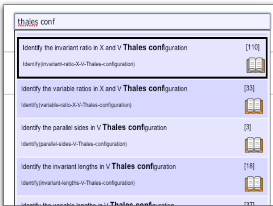
Figure 2: Competencies triggered by "Thales conf".

http://www.activemath.org/projects/SkillsTextBox/ .