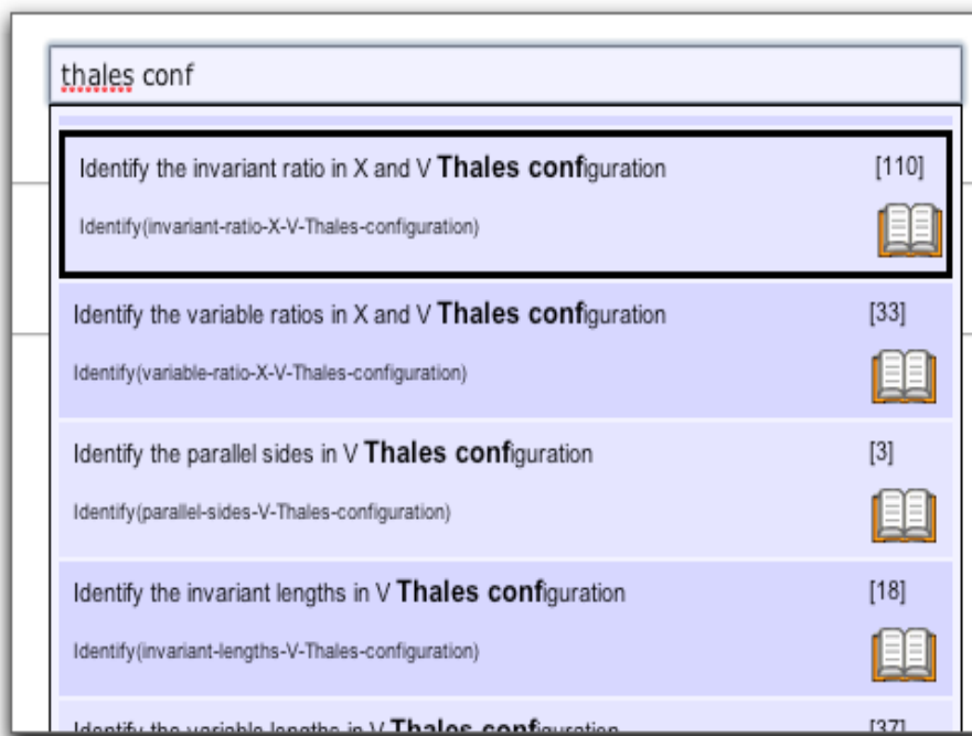
Figure 2: Competencies triggered by "Thales conf".

http://www.activemath.org/projects/SkillsTextBox/ .