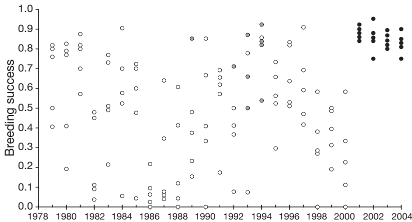
Fig. 2. Calonectris diomedea . Cory's shearwater breeding success in the 5 sub-colonies under study according to year and rat management options showing breeding success at sub-colony level without rat management (○), with rat control (◐) and after rat eradication (●)

Significant differences in breeding success were detected when we compared breeding success before eradication, between sub-colonies where rats were