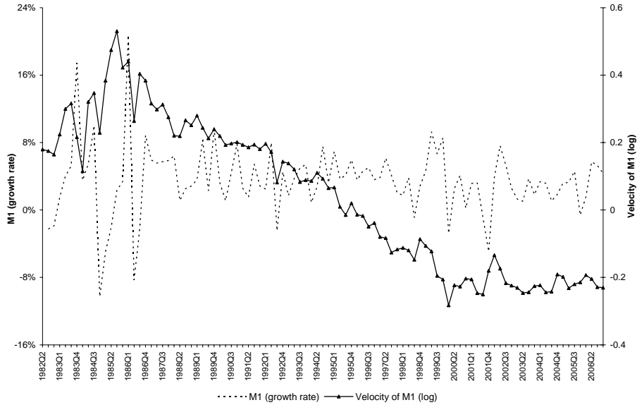
Figure 1. M1 growth rate and Income velocity

We conducted a series of stationarity test for our data. The model rests upon the stationarity of the series. Where a series is not stationary, the relationships derived in the estimation procedures are spurious (Granger and Newbold, 1974). Two criteria to test for non-stationarity are employed: KPSS and DF-GLS. KPSS (Kwiatkowski, et. al. , 1992) tests for the null hypothesis of stationary series against the alternative of non-stationarity while the Dickey-Fuller with GLS de-trending (Eliot, et. al. , 1996) tests for the null hypothesis of non-stationarity against the alternative of stationarity. Careful inspection of our data series suggests that, in order to correctly specify our tests, only the drift term should be included in the null and alternative hypotheses for growth rate of M1. On the other hand, both the drift and time trend should be included for the income velocity (log) series. Table 1 displays the results. M1 growth rate is a stationary series using KPSS and DF-GLS criteria. Income velocity is non-stationary using KPSS and DF-GLS.