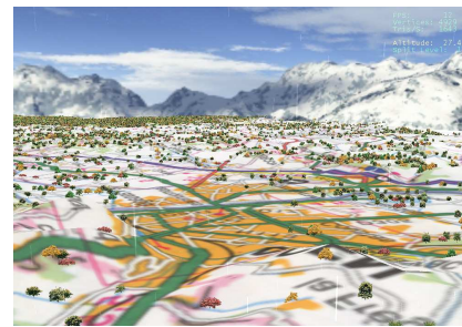
Figure 2: AutoMNT terrain navigator

AutoMNT 1 also embeds a terrain viewer and navigator using the Duchaineau's Real-time Optimally Adapting Meshes (ROAM) algorithm (see Figure 2).