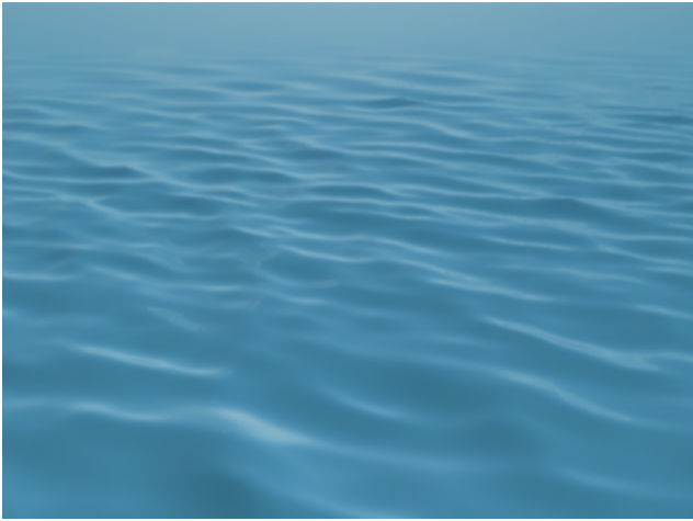
Figure 2: Adaptive mesh with a screen resolution of 1024 \times 768 pixels, a 256 \times 192 points mesh, 400 waves and a wind speed of 5 \text{ m}\cdot\text{s}^{-1} . The framerate is from 5 to 12 fps with PASS method (less than 1 fps with sincos).

time by about a factor 2. For the PASS method, computations took place along lines which are orthogonal to the direction of the wind. Since the majority of waves runs in a direction close to the direction of the wind, this decreases the sum of frequencies of the partials and advantages the method.