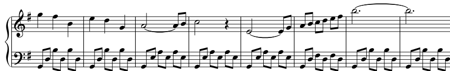
Fig. 1. Polyphonic excerpt of Swan Lake by Tchaikovsky.

represent a chord composed of n_2 and a tied note n'_1 , where n'_1 has onset time o(n'_1) = o(n_1) , pitch p(n'_1) = p(n_1) but with a smaller duration d(n'_1) :