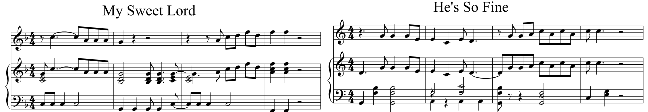
Figure 3: Manual transcriptions of excerpts (corresponding to motif A and motif B) of the two songs My Sweet Lord (G. Harrison) and He's So Fine (R. Mack).

results obtained by our system (top 3 with associated similarity scores). As expected, the first musical piece of the database estimated as the most similar is the query. The score of the rank 1 thus corresponds to the maximum score. Here, the most important result is the ranked 2 piece. Ideally, it has to correspond to the melody associated to the plagiarism established by the court. Tab. 2 shows that it is always the case, at the exception of the case Fantasy vs Fogerty . This error shows the limitations of the current system (see Section 5 for discussion). For all the other cases, the detection system gives the results expected. For cases like Selle vs Gibb or Heim vs Universal for example, the similarity is evaluated as important. However, the limitations of the system are also shown by the little difference between ranked 2 and ranked 3 scores for the case Repp vs Webber . The low score for the rank 2, corresponding to the near-duplicate piece, induces low differences between this score and the other ones obtained with the other pieces of the database. That's why more musical elements have certainly to be considered in order to reduce these differences and to make the system more robust.