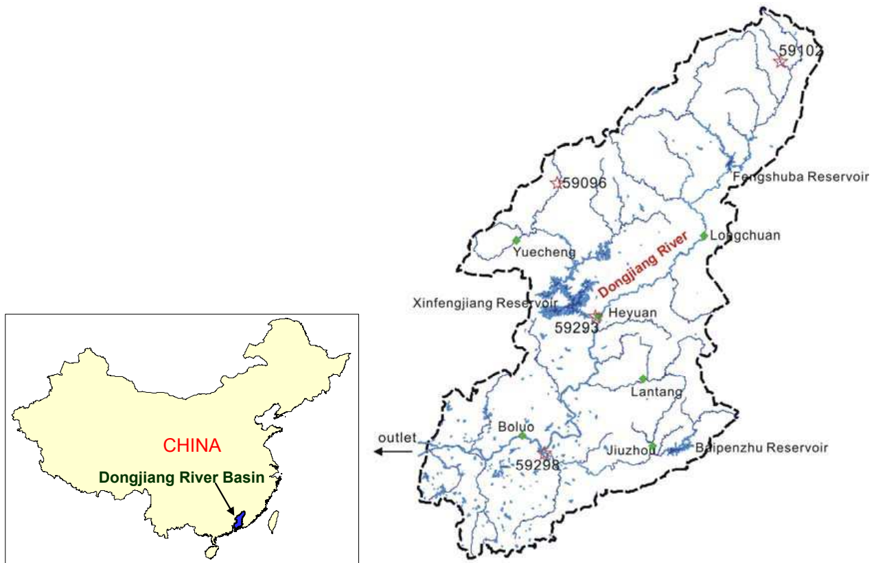
Fig. 1. Location of the study area (left) and locations of gauging stations (right). (Note: the star symbols denote meteorological stations, and the diamond symbols denote hydrological stations).

On the other hand, in the context of significant global changes in many regions, whether or not the streamflow processes has changed is of great concern because streamflow processes are mainly driven by meteorological processes, and possibly more extreme weather may result in higher flood and drought risks. Some results show increases in extreme events. For example, when investigating the relationship of changes in the probability of heavy precipitation and high streamflow over the contiguous United States, Groisman et al. (2001) showed that the variations of high and very high streamflow and heavy and very heavy precipitation are similar. In a recent study, Zhang et al. (2005a) evaluated the relations between the temperature, the precipitation and the streamflow during 1951–2002 of the Yangtze River basin, suggesting that the present global warming will intensify the flood hazards in the basin. At the same time, some others show no significant change in extreme flood events. For instance, Mudelsee et al. (2003) found no upward trends in the occurrence of extreme floods in central Europe; Kundzewicz et al. (2005) showed that the analysis of annual maximum flows does not support the hypothesis of ubiquitous growth of high flows.