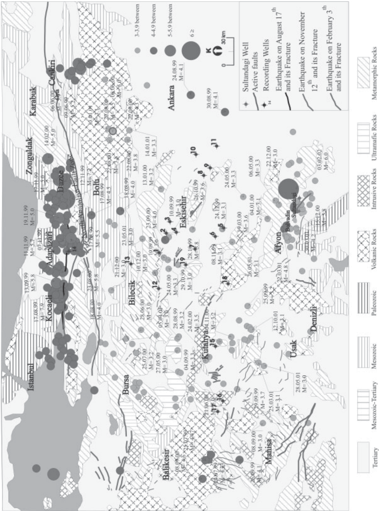
Fig. 1. The location of the recording wells on a simplified geological and fracture map (modified by MTA, 1997).