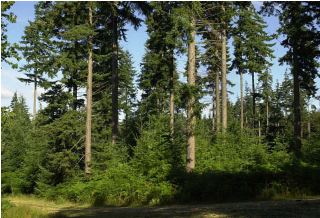
Fig. 3. A site undergoing transformation to continuous cover forestry.

germination and subsequent seedling survival (Mason et al. , 1999). The development of appropriate thinning regimes has the potential to make CCF an option on a substantial part of the British forest estate, although large parts of the uplands are likely to remain unsuitable due to site exposure and the high risk of windblow. The Welsh Assembly Government has directed that 50% of the publicly owned Welsh woodlands should be brought into a CCF regime by 2020.