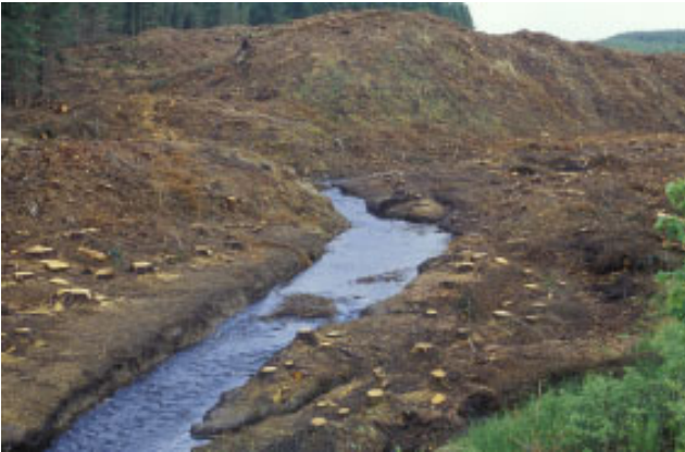
Fig. 1. The removal of dense shade from streambanks is helping to improve the freshwater environment within upland forests.

environmental and other sensitivities. This includes the need for a significant proportion of open land for other habitats such as upland heath, as well as to enhance heritage and recreation. Crucially, the plans are subject to meaningful consultation with a wide range of stakeholders, ensuring an equitable balance is achieved among all interest groups. The productive forest often remains at the core of the structure but in such a way that planned fellings are of an appropriate scale and related to landform, and replanting ensures an increasing diversity in tree species and age. Another key element is the re-design of streambanks to form a native riparian woodland habitat network and wildlife corridor stretching throughout the whole water catchment. First rotation stands that cast dense shade over the water's surface are progressively being cleared back from streams, to be replaced in time by an open canopy of mainly native broadleaved woodland (Fig. 1). This is transforming the freshwater environment within conifer plantations.