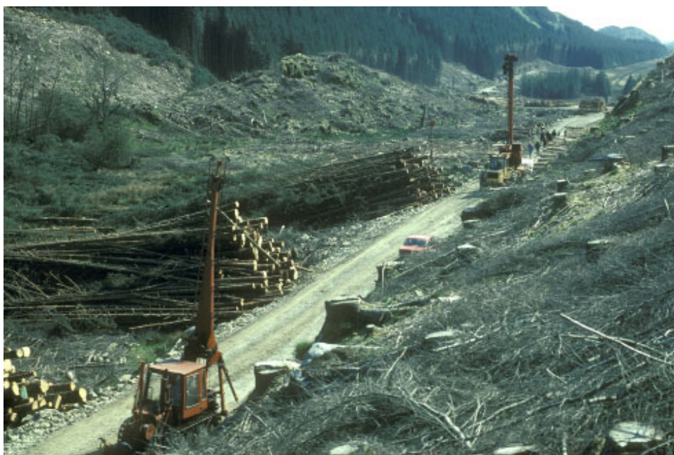
Fig. 4. Research has demonstrated the effectiveness of best practice in minimising the impact of clearfelling operations on the freshwater environment.

problems through preventative measures and biological control wherever possible. A new Forestry Commission Practice Guide ‘Reducing Pesticide Use in Forestry’ was published in 2004.